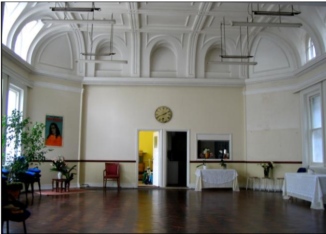
Social hall before renovation

The pictures following show new renovations to the social hall, and the proposed chapel design.